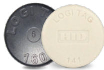
Logi Tag® 160/161