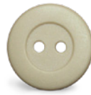
Logi Tag® Button 162