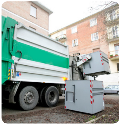
HID can create a custom tag solution to fit your application requirements for chip type, dimensions, programming and materials.

*Flame Resistance UL94-HB not applicable for spacer of INTag 500 OM or INTag 500 UHF OM.